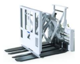
Push and Pull Slip Sheet Attachment