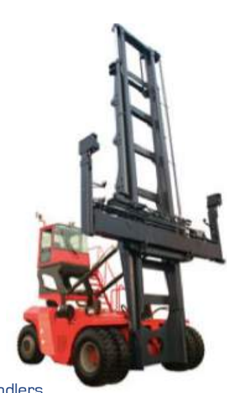
HELI Container Handlers