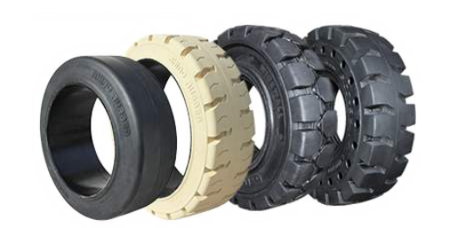
Standard - Solid - No Mark Tires