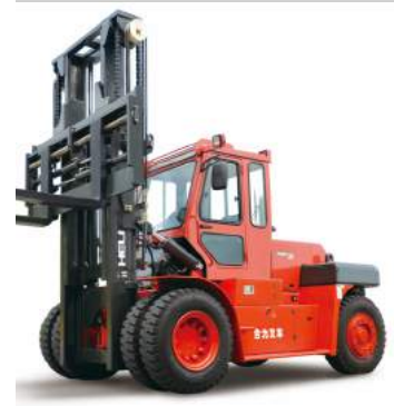
Internal Combustion Engine Forklifts - Diesel - Petrol - Dual Fuel (LPG) Capacity 1 - 42 Tons & Extended Lift Height up to 7 Meters