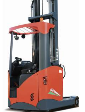
High Efficiency Electric Stackers 2.5 tons